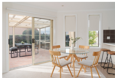
Sunroom off dining area