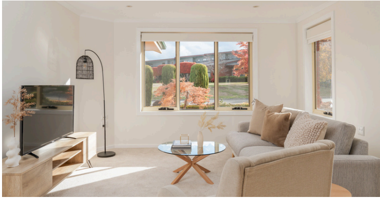
Comfortable lounge and living

Five different floor plans are designed to maximise the views of the lakes, gardens and surrounds. Each villa is designed in a neutral colour scheme to create a unique blend of elegance and affordable luxury.